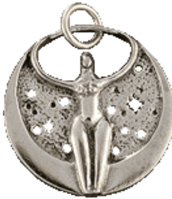
Star Goddess Solid Cast bronze 1 ¼" Made in the USA #SGB bronze...Regular price $12.50W, Sale $11