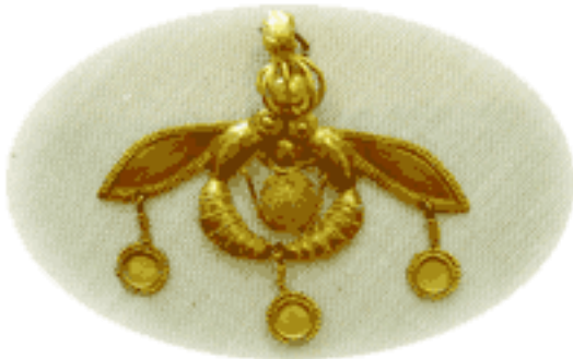
MINOAN BEE PENDANT – Our Reproduction of the finest museum quality 4000-year-old gold work. (pictured) BEE LOVE! 22kt Gold Plate (1 3/8" wide) # PBG Reg $10W - Sale $9

Celtic Wheel – variations on this ancient pre-christian cross is found all over the world – from New Mexico Pueblo ruins to Celtic hoards...the cross contained within the circle celebrates the balance of masculine & feminine energies. Our own unique version, embellished with knotwork reminds us that