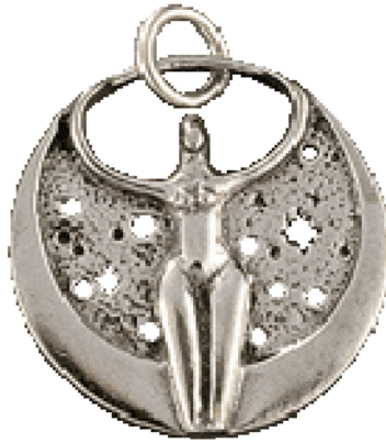
Star Goddess Solid Cast bronze 1 1/4" Made in the USA #SGB bronze...Regular price $25, Sale $22