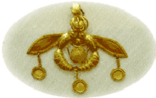
MINOAN BEE PENDANT – Our Reproduction of the finest museum quality 4000-year-old gold work. (pictured) BEE LOVE! 22kt Gold Plate (1 3/8" wide) #PBG Reg $20 - Sale $18

Celtic Wheel – variations on this ancient pre-christian cross is found all over the world – from New Mexico Pueblo ruins to Celtic hoards...the cross contained within the circle celebrates the balance of masculine & feminine energies. Our own unique version, embellished with knotwork reminds us that